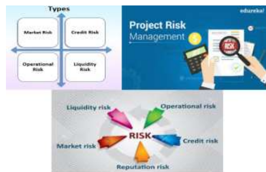
Fig. 2. Risk management analysis in petrochemical industries

Emerging risks are not easily understood because their scope of expansion and potential impacts are unclear, but they are dangerous because they can quickly become major losses for the insurance industry. Professional identification and evaluation of emerging risks is an emerging element in risk management and distinguishes corporate risk management from traditional risk management. Score's strategy for identifying emerging risks is to form an internal network of observations and reports from legal experts, claims experts, insurers and risk managers, combining external information sources with insurance experts for the entire insurance industry to filter and evaluate. It is worth to say that identifies emerging risks. Although the main purpose of processing an emerging risk is to avoid unexpected losses and increase its unpredictability, it can be used to identify potential strategic opportunities associated with emerging risks [22].